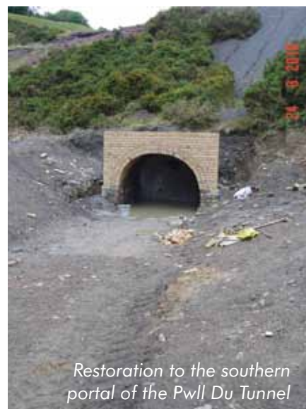
Restoration to the southern portal of the Pwll Du Tunnel

perhaps, in the longer term, a possible extension of the World Heritage Site. By considering the adjoining areas as a buffer zone, the whole Forgotten Landscapes Project Plan area can be considered as one unit – a core site and a buffer zone. This will enable similar standards of management supported by shared policy commitments between the Blaenavon World Heritage Site Partnership and the Forgotten Landscapes Partnership.