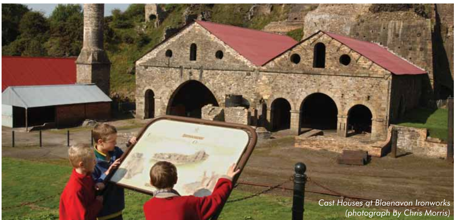
Cast Houses at Blaenavon Ironworks