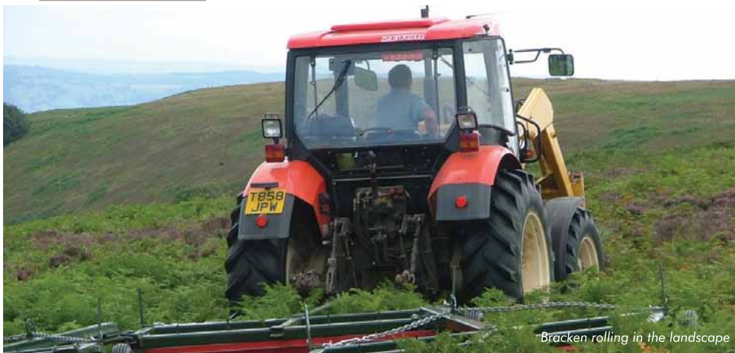
Bracken rolling in the landscape

The Heritage Lottery Fund has provided 60% of the funding with the rest coming from bodies including the Welsh Assembly Government's Heads of the Valleys Programme, Valleys Regional Park, the Environment Agency and the Countryside Council for Wales.