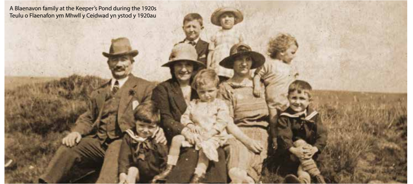
A Blaenavon family at the Keeper's Pond during the 1920s Teulu o Flaenafon ym Mhwll y Ceidwad yn ystod y 1920au

If your ancestors lived or worked in the Blaenavon area, the Blaenavon Community Heritage and Cordell Museum can help you discover the role they played in the World Heritage Site story.