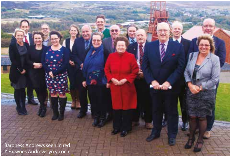
Baroness Andrews seen in red Y Farwnes Andrews yn y coch

The Blaenavon Partnership, which is led by Torfaen Council, was established in 1997 with the aim of obtaining World Heritage Status for Blaenavon, and continues to conserve the landscape and promote it as a place to live, work, visit and invest.