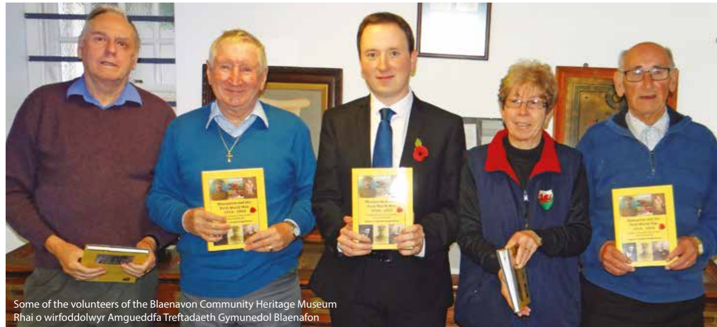
Some of the volunteers of the Blaenavon Community Heritage Museum Rhai o wirfoddolwyr Amgueddfa Treftadaeth Gymunedol Blaenafon

For more information call 01495 790991, email blaenavoncordellmuseum@hotmail.co.uk or find us on Facebook!