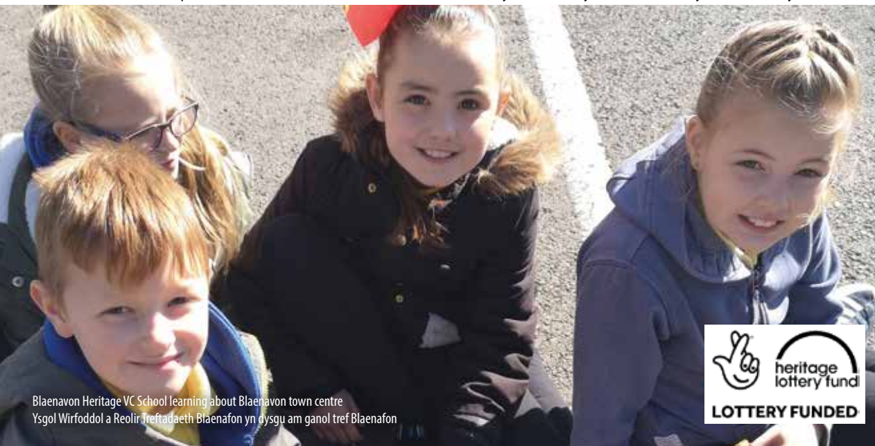
Blaenavon Heritage VC School learning about Blaenavon town centre Ysgol Wirfoddol a Reolir Treftadaeth Blaenafon yn dysgu am ganol tref Blaenafon