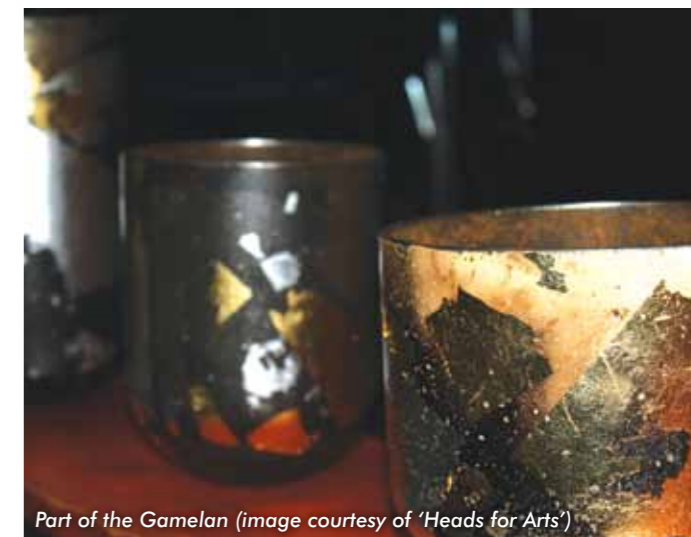
Part of the Gamelan