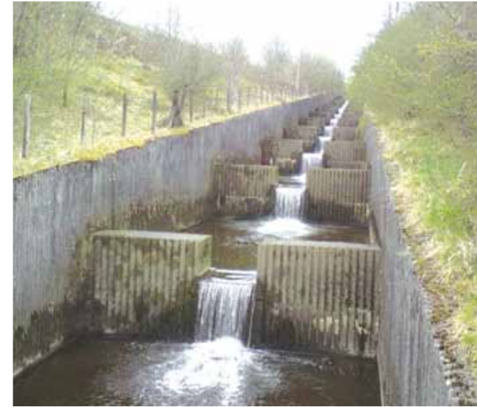
Micro hydro scheme will be installed at the Dragon's Teeth on the Afon Lwyd