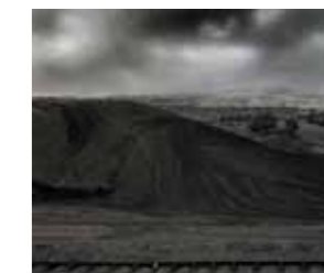
Lower Garn Terrace in 1978

For more information telephone: 01495 742333 or email blaenavon.tic@torfaen.gov.uk