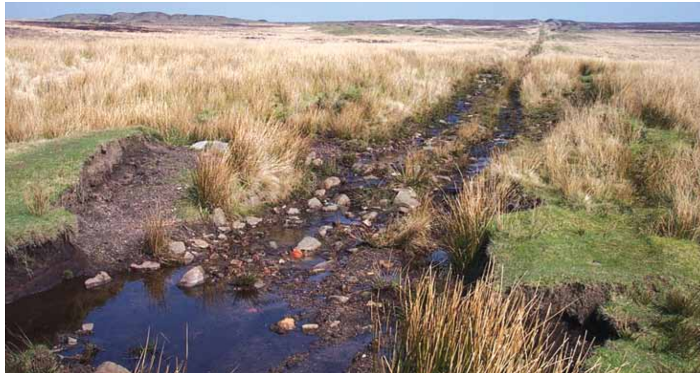
Damage to Dyne Steel incline - an important part of the Iron Mountain Trail - will be repaired by FLP