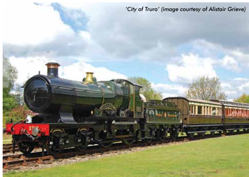
'City of Truro'

For more information telephone 01495 792263 or visit www.pontypool-and-blaenavon.co.uk