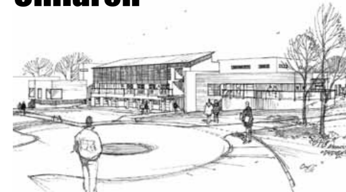
An artist's impression of the completed campus

The school and leisure elements of the Blaenavon Community Campus received the green light from Torfaen County Borough Council's planning committee on 20 April 2010, when the project's detailed planning application was unanimously approved. The go-ahead was given for a brand new 450-place primary school, a 130-place nursery, dedicated 'Flying Start' areas and new leisure facilities. The campus will include a two-court badminton hall, a fitness suite, a dance studio and an outdoor Multi Use Games Area with associated changing rooms.