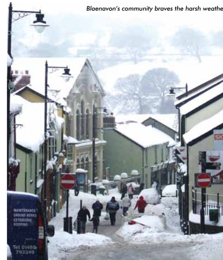
Blaenavon's community braves the harsh weather

"Rydym yn gwybod mai'r haf hwn fydd y gorau eto ym Mlaenafon. Eleni rydym yn dathlu degawd ers i ni dderbyn Statws Treftadaeth y Byd! Rydym hefyd yn dathlu cymuned sydd cyn gryfed a gwydn ag erioed."