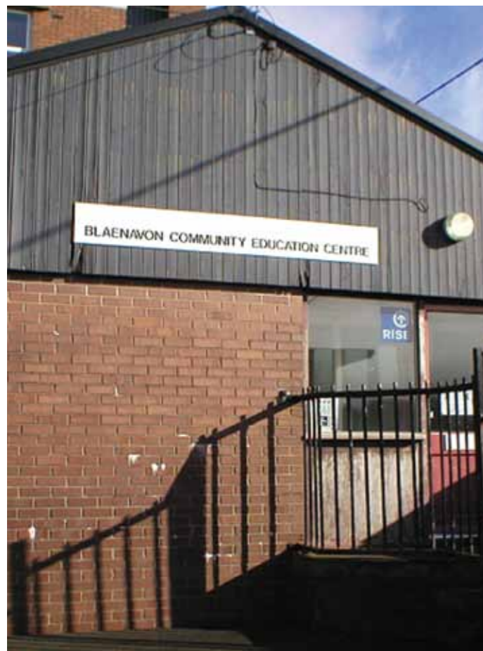
The former Community Education Centre in Park Street

Do come and join us and enjoy the excellent facilities at this centre. We look forward to welcoming you.