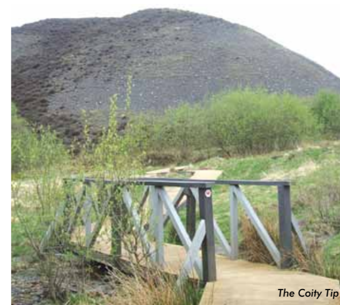
The Coity Tip

For further details about these events, please visit www.museumwales.ac.uk