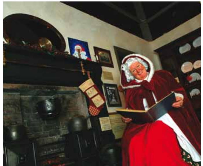
Mother Christmas at Big Pit

For further details, please contact Big Pit on 01495 790311 or visit www.museumwales.ac.uk