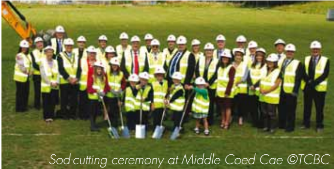
Sod-cutting ceremony at Middle Coed Cae

Construction work has started on Blaenavon's £13 million community campus. On 5th July, the Welsh Assembly Minister for Social Justice and Local Government, Carl Sargeant, cut the first sod in a ceremony at the site. The 450-place school, which will replace St. Peter's CV Primary, Hillside Primary and Hillside Nursery, has been named 'Blaenavon Heritage VC Primary School', following a competition by local schoolchildren. The name is a combination of names suggested by Hillside Primary pupils, Gethin Jones and Steffan Thomas. Steffan proposed 'Ysgol Blaenavon Heritage Campus' while Gethin suggested 'Hopkins Heritage School' in tribute to Sarah and Samuel Hopkins, early proponents of education in Blaenavon.