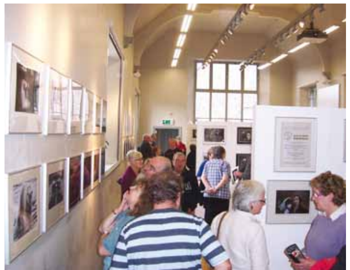
Launch of the PAGB Print Exhibition October 2010

For more information telephone 01495 742333 or email Blaenavon.tic@torfaen.gov.uk