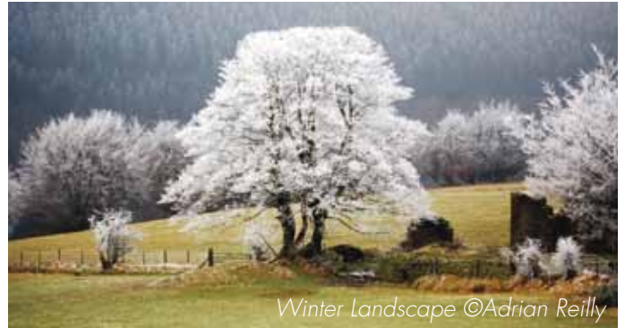
Winter Landscape

and provide lectures are organisations such as the RSPB, Blaenafon Mountain Tours and the Welsh Orienteering Association to name a few. Spaces are limited so we recommend you book. Call the Blaenafon World Heritage Centre on 01495 742333 or email Blaenafon.tic@torfaen.gov.uk for more information.