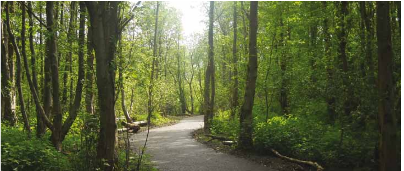
Forgeside Community Wood

Am ragor o wybodaeth cysylltwch â Chanolfan Treftadaeth y Byd Blaenafon: 01495 742333.