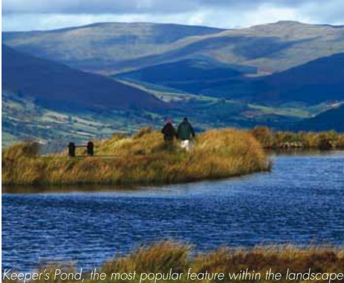
Keeper's Pond, the most popular feature within the landscape

Since the previous edition of Heritage News the Forgotten Landscapes Scheme has really taken off. As you may have heard this landscape scale scheme has ambitious plans to conserve and promote the Blaenavon Industrial Landscape and its surroundings.