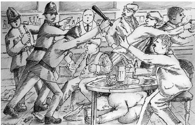
‘An American Hold-up in the Cambrian Inn 1939’ ©Mary Challenger

The publication of From Funeral to Festival has been funded by the Forgotten Landscapes Partnership. The book is expected to be on sale in local bookshops by the spring. For more information about WEA Courses in Blaenavon please phone 01495 791128.