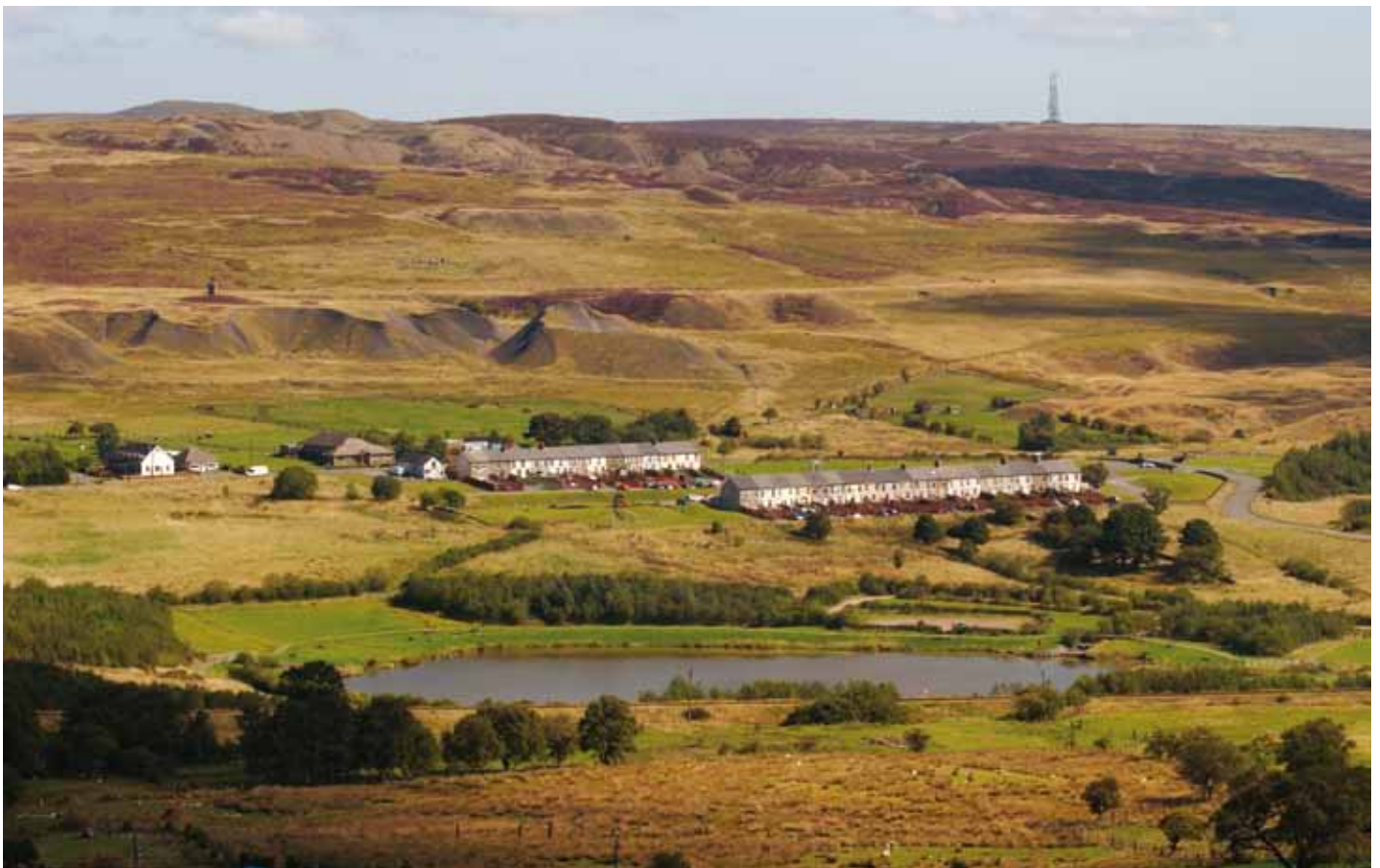
Blaenavon's dramatic and historically significant industrial landscape