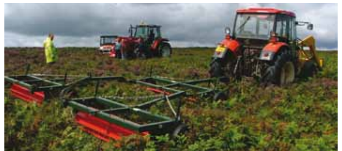
Bracken rolling on the landscape