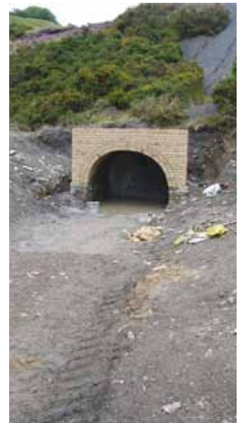
Restoration to the southern portal of the Pwll Du Tunnel