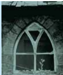
Seniors' Garden before and after