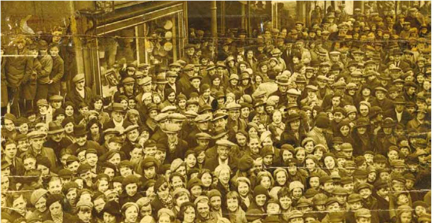
'A large crowd of Blaenavon people await the proclamation of King Edward VIII in Lion Street (1936), photo courtesy of Pat Morgan