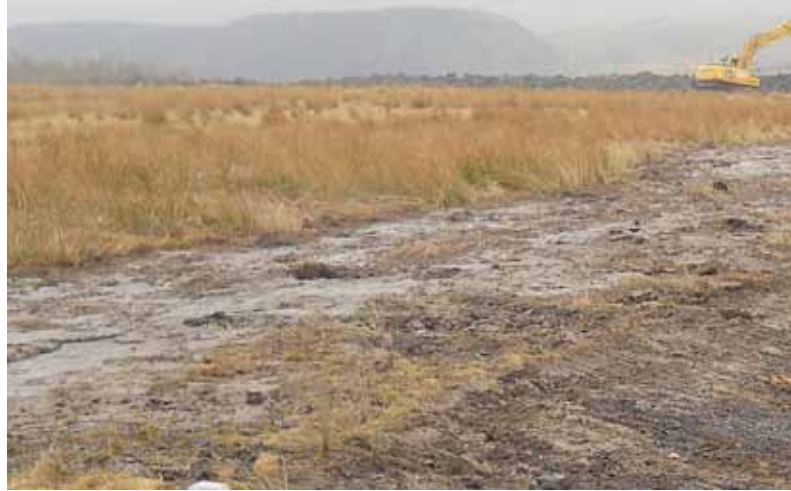
The new reed bed