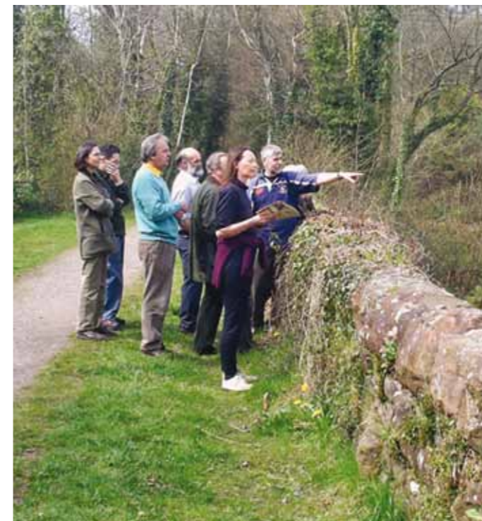
Govilon Heritage Trail

The new leaflet, price 20p, is available from local shops and tourist information centres.