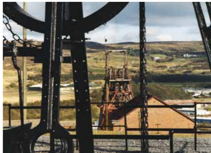
Some of the winning entries