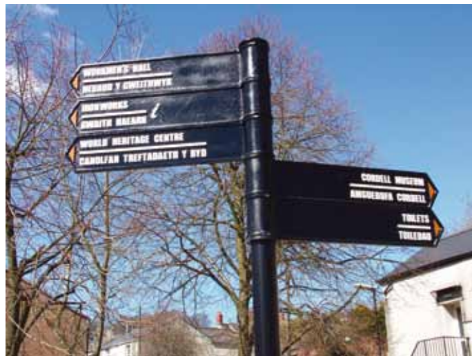
Pedestrian finger post sign

Blaenavon benefited from £185,000 grant funding from the Heads of the Valleys – a new Welsh Assembly Government initiative aimed at tackling the social, economic and physical regeneration of the Heads of the Valleys area. The money was spent on installation of pedestrian finger post signs within the town centre. The signs have been designed in the World Heritage Site brand and have been placed in locations encouraging visitors to follow a route right through the town which takes in the main retail area helping to support local businesses and encourage trade. Blaenavon Park also got a face lift with improvements to the rugby and bowling