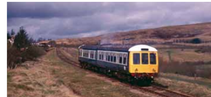
Under a brooding sky, one of our elderly Diesel Multiple Units rasps noisily up the bank to Whistle Inn, offering peerless views of the workings at Pwll-Du – a central element in the Blaenavon Industrial Landscape

The Pontypool and Blaenavon Railway is a rather modest member of over a hundred Heritage Railways in the UK. Its runs on a line that was closed to passengers in 1941, to goods a few years later and finally to coal in 1980. The line suffered grievously in the early sixties during the 'out with the old in with the new' that pervaded our society then, and, as a result, what remained of the built environment was scant to the point of non-existence. So is the railway truly a Heritage Railway? Visitors to Heritage Railways do not necessarily arrive with lofty ideals in mind, not for them the worthy notion of 'interpretation', but rather a day out with the kids and a ride on the train, a cup of tea, and pop and bag of crisps for the youngsters. On the face of it, we are simply a tourist attraction.