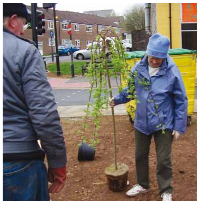
Future Blaenavon Prince Street works

pupils from local schools. The Group hope that the project will lead to other similar projects around the town. Future Blaenavon meets at 6.45pm on the first Thursday of each month at the Torfaen Voluntary Alliance offices at Church View, and all are welcome!