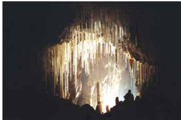
The spectacular 'Straw Grotto' Chamber