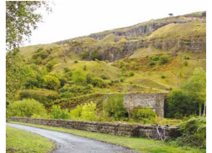
Clydach South Station

The first phase of surfacing works on the scenic eastern section of the National Cycle Network Route 46 'Heads of the Valleys Cycleway' has recently been completed by Sustrans, the National Cycling Charity, between Llanfoist, near Abergavenny, and Clydach. The mostly off-road route follows the gentle gradient of the former Merthyr, Tredegar and Abergavenny Railway line and provides a safe environment for young families, while the smooth running surface is ideal for users with pushchairs or wheeled mobility aids.