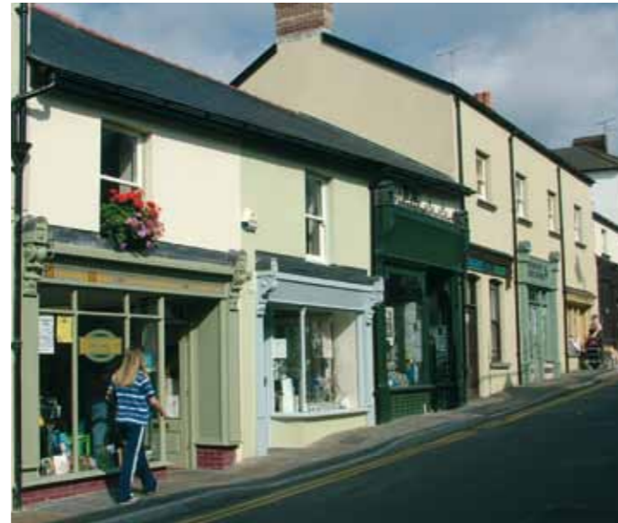
32-39 Broad Street

Congratulations to local builders P & P Building and Roofing Contractors on being awarded winners in the Welsh Regional Final of the Federation of Master Builders Awards. The Blaenavon based company has won the Commercial Category for its work in restoring 32-39 and 73-86 Broad Street which is being funded by Torfaen County Borough through its Neighbourhood Renewal Area Scheme.