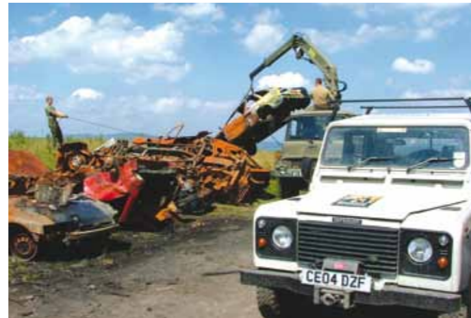
Caption - The army picked up thirteen cars which were a major eyesore