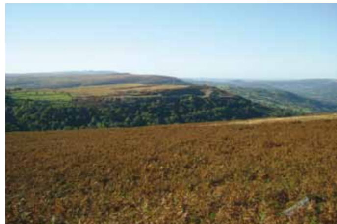
Limestone landscapes: There are 150 km of cave systems in the area

Caves occur anywhere there is limestone, but the fact that Blaenavon was at the South edge of the ice field at the end of the last ice age has made the area of particular importance. Over many thousands of years groundwater and rainwater has dissolved the soluble limestone, ultimately creating the caves.