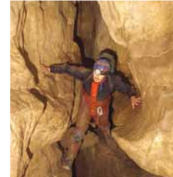
The Indiana Highway