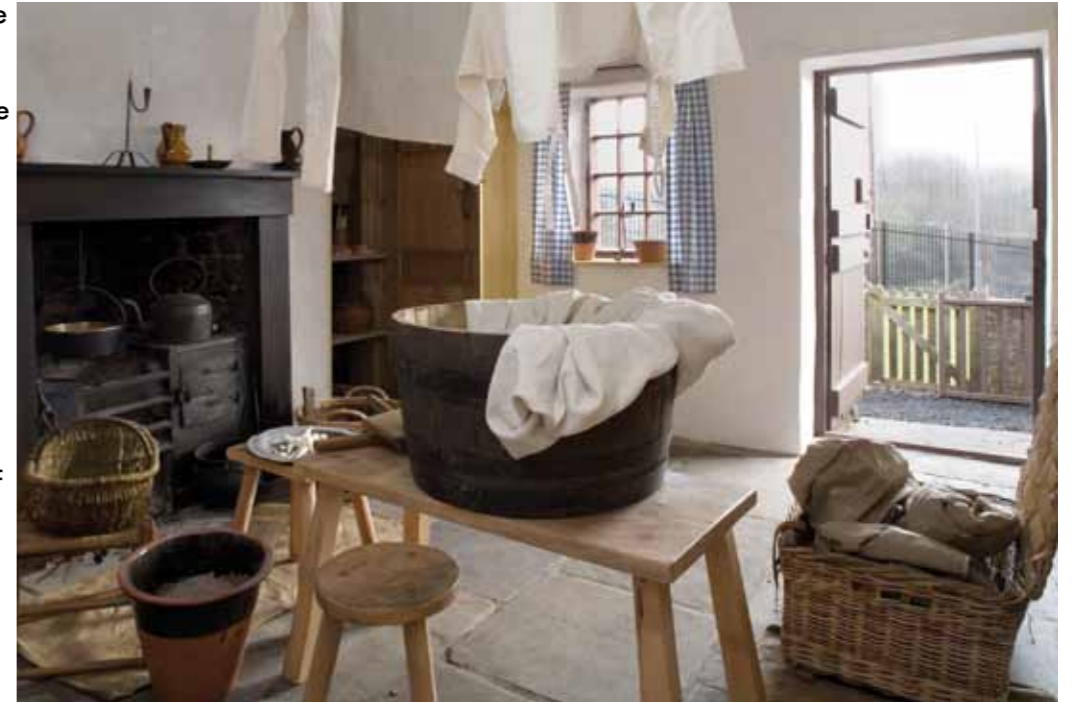
Back to basics!

Father and older son will brave life down the pit each day enduring the intense physical demands of shoveling coal and hacking at the coal face. It was a time when there was little mechanization and most of the coal was cut by hand. Men worked up to 12 hours a day in cramped and