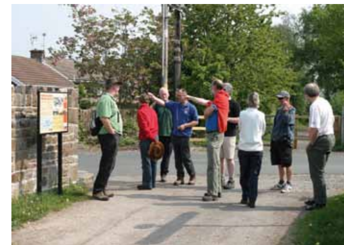
Govilon Heritage Group and visitors on a recent walk

November saw the launch of the Govilon Heritage Group's Heritage Trails. This year the Group are providing guided walks around the Trails in partnership with Brecon Beacons National Park and the Blaenavon World Heritage Site (BWHS).