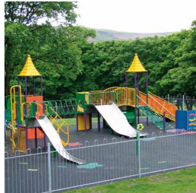
New play area at Blaenavon Park