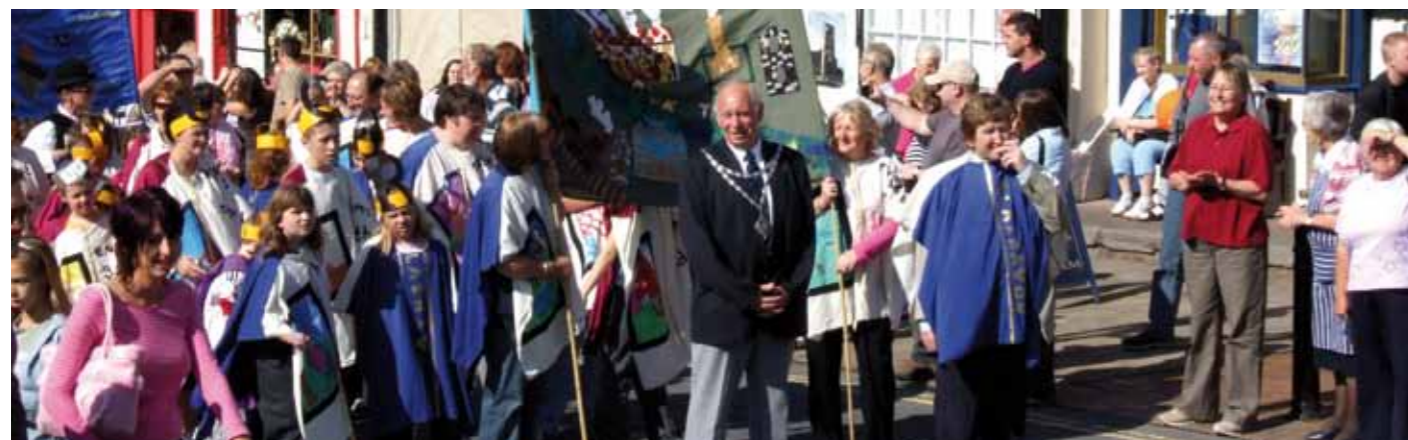
The World Heritage Day parade at Ironbridge