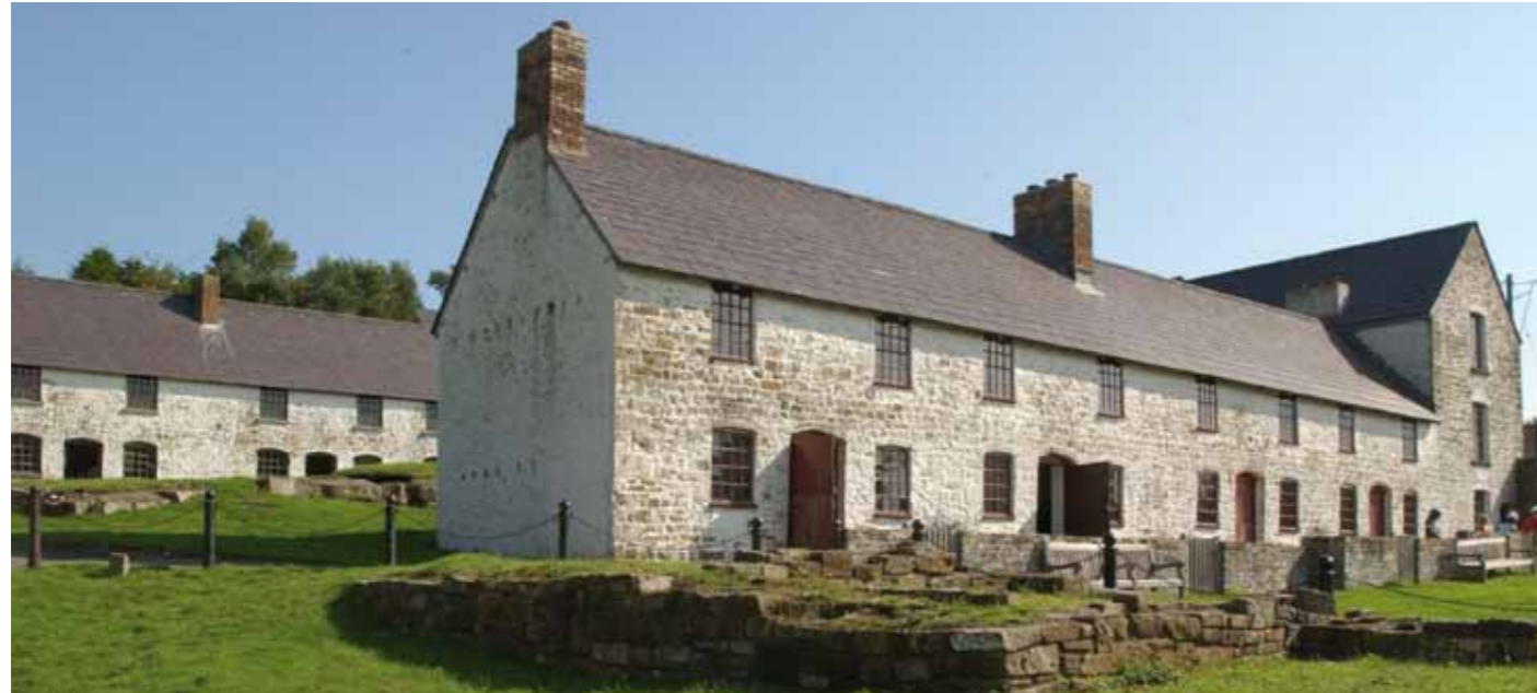
Stack Square, Blaenavon Ironworks, where the families will live

One of the most ambitious reality TV challenges to date is going to be made in Blaenavon and broadcast on BBC1 Wales this autumn.