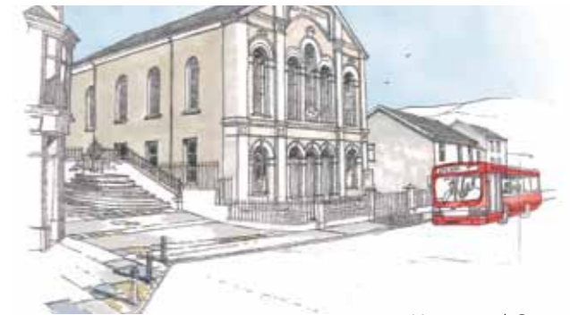
View towards George Street

The junction of Ivor Street with Broad Street will also be improved with traffic calming measures in the form of chicanes introduced along the one-way system. Widespread public consultation has taken place and comments have been taken into account in finalising the system. Implementation of the system will commence later in the year.