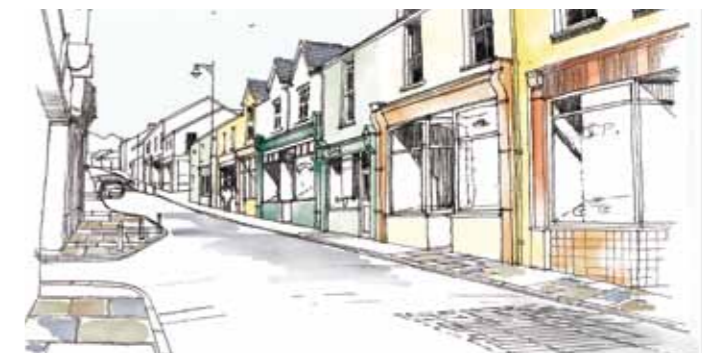
View from Burford Street junction