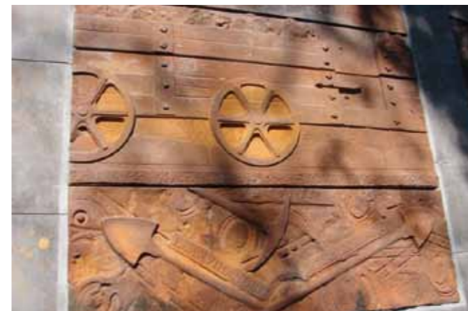
Artwork at Llanfoist

Llanfoist is within easy walking and cycling distance from both the bus and rail stations in Abergavenny, via Routes 42 and 46 of the National Cycle Network through Castle Meadows. Visit the Sustrans website www.sustrans.org.uk for further details.