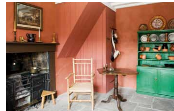
Inside one of the cottages

squalid conditions and often had to walk home for several miles after finishing a shift.