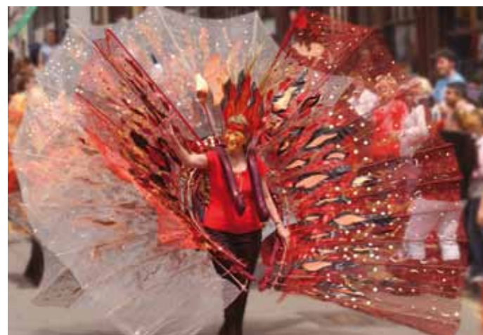
The spectacular World Heritage Day Parade costumes

Alongside the work with school children, SWICA is inviting everybody from Blaenavon and the surrounding area to come to the free workshops and have some fun, making willow sculptures, costumes and props for the Heritage Parade. Even if you only have a small amount of time to spare, pop in and get involved in the sticking, gluing, printing, painting, designing, sewing, decorating and drumming! All welcome, no previous experience necessary all materials provided!