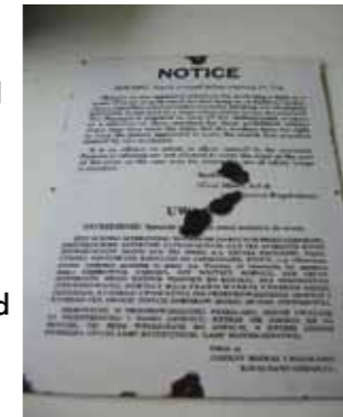
English/Polish colliery notice

This idea for the booklet came from my own personal experience of working alongside fellow workmen at Cwm Colliery who had very strong east European accents and equally strong work ethics. I was fascinated by their stories about Monte Cassino or the partisan war in the former Yugoslavia and I marvelled at both their