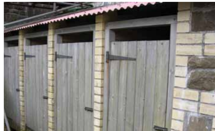
Communal outside toilets

The families will leave the 21st century for 3 weeks and live in a 1920s world. All traces of creature comforts will be removed from the house: there will be no TV, PC, washing machine or microwave oven. The children will have to live without their I-pods and mobile phones and will be unable to talk to their friends for the