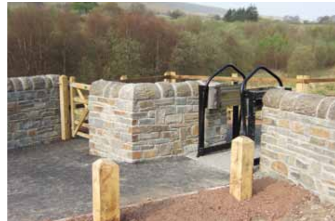
Entrances to Garn Lakes

Conditions have also been created to encourage rare Lapwing birds to nest at the lower end of the site and it is hoped that they will nest here for the first time in many years!