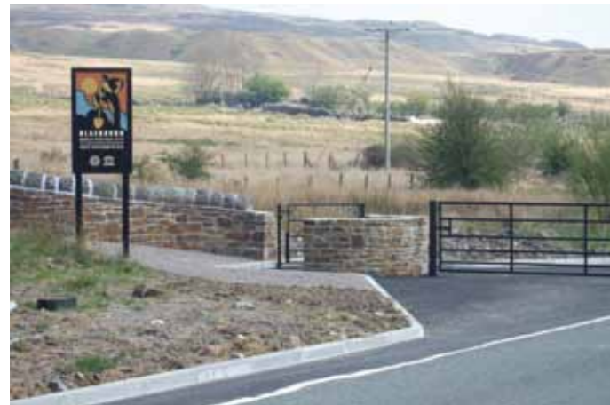
Improvements to the road approaches on the B4248 at Blaenavon

Over the winter, works to the road corridors into Blaenavon have significantly improved the approach to the town thanks to funding from the Heads of the Valleys programme. Following detailed consultation with local residents and members, the entrance to Garn-yr- Erw along Garn Road has been transformed with new timber fencing, walling and signage dramatically enhancing the entrance to the village. The boundary sign at Whistle Road has been improved and at Llanover Road a new parking area has been created, signs and seats installed and stone walls erected following consultation with the Blorenges Commoners Association.