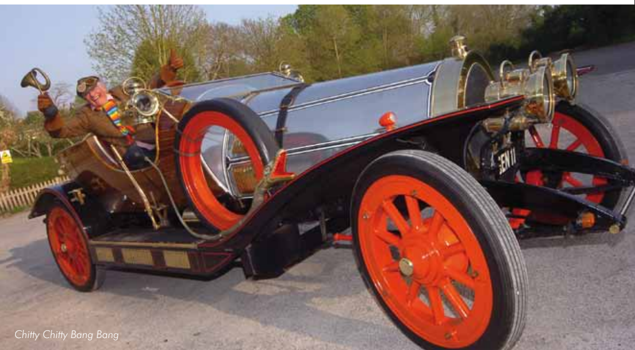
Chitty Chitty Bang Bang