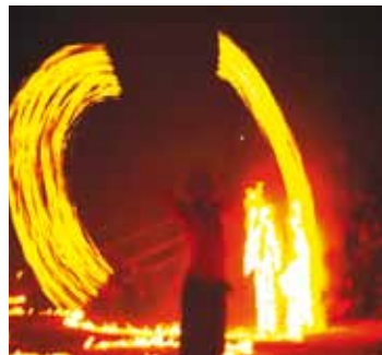
Scene from last years event

On Thursday 6th December, the streets of Blaenavon will be ignited by a parade of magnificent lanterns, music and light led by a giant smoke belching "King Dragon". The parade, which will start at 6:00pm from Market Street car park, will proceed up Broad Street and enter the Ironworks where a spectacular fire finale will tell the story of how Blaenavon grew from a rural wilderness to a bustling centre of industry.