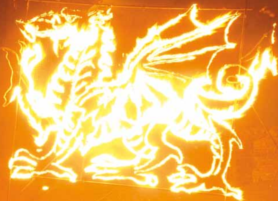
Flaming Dragon from last years event