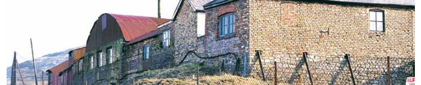
Big Pit, Blaenavon

For more information on what's on at Big Pit, please visit www.museumwales.ac.uk or telephone 01495 790311.