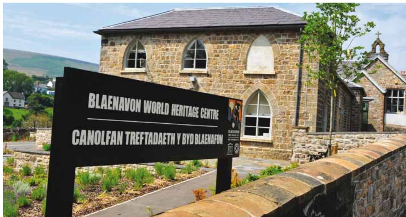
Blaenavon World Heritage Centre