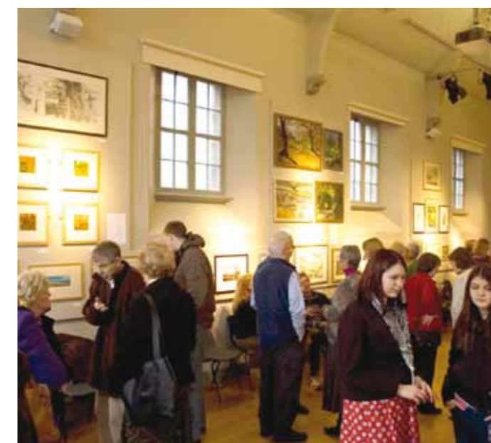
'After the Fire' Launch.