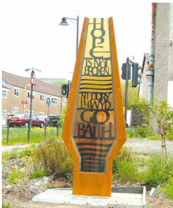
The public art structure in Prince Street

Ariannwyd y ddau gelfyddydwaith gan Gronfa Adfywio Ffisegol Llywodraeth Cynulliad Cymru a'r Adran dros yr Economi a Chludiant. Am ragor o wybodaeth am y prosiect, cysylltwch â Thim Prosiect Blaenafon ar: 01633 648319.