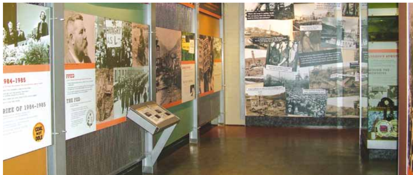
Surface Exhibitions at Big Pit

Am ragor o wybodaeth ffoniwch: 01495 790311 Gwefan: www.museumwales.ac.uk/en/bigpit/