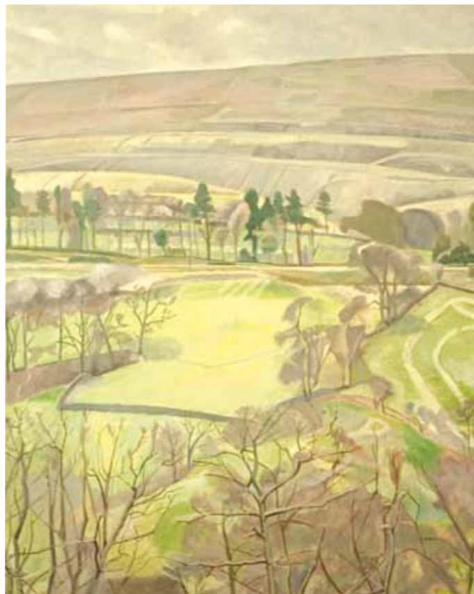
Painting by Tony Tribe

If you require more information on any of the courses please contact Blaenavon CEC on 01495 792013 or The Settlement, Pontypool on 01495 742600.