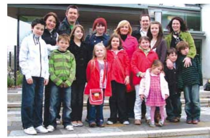
The Coal House Families at Heritage Café