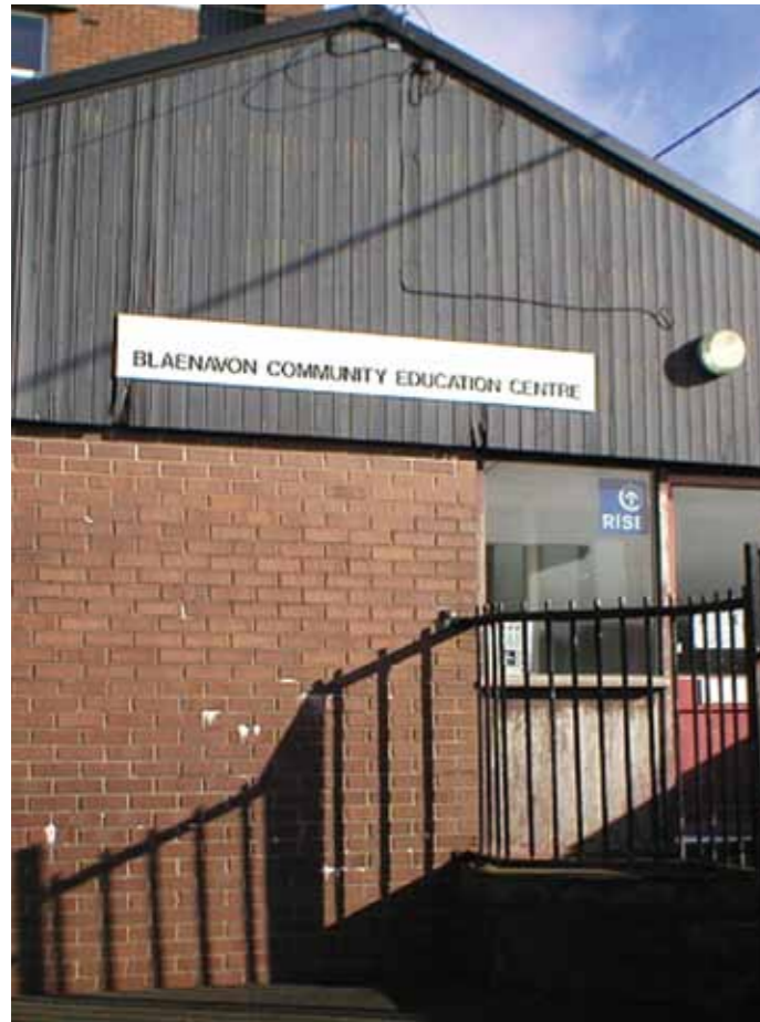
The former Community Education Centre in Park Street

Do come and join us and enjoy the excellent facilities at this centre. We look forward to welcoming you.