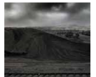
Lower Garn Terrace in 1978

For more information telephone: 01495 742333 or email blaenavon.tic@torfaen.gov.uk