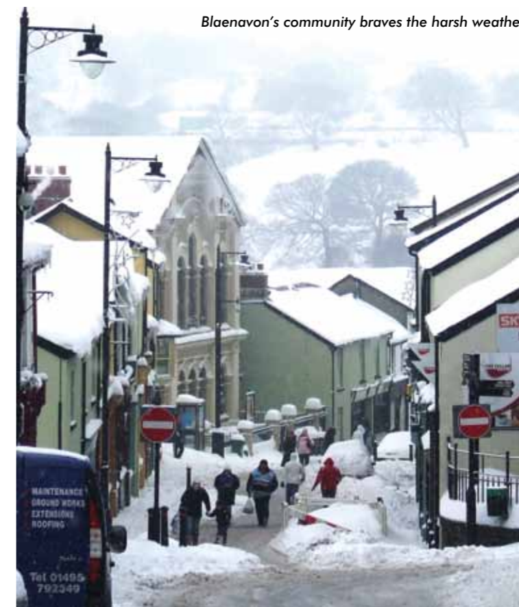
Blaenavon's community braves the harsh weather

"Rydym yn gwybod mai'r haf hwn fydd y gorau eto ym Mlaenafon. Eleni rydym yn dathlu degawd ers i ni dderbyn Statws Treftadaeth y Byd! Rydym hefyd yn dathlu cymuned sydd cyn gryfed a gwydn ag erioed."