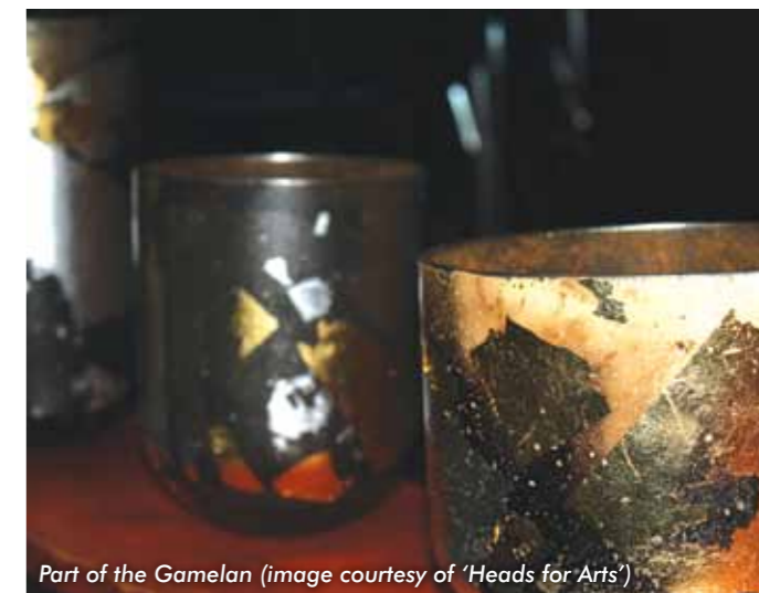
Part of the Gamelan