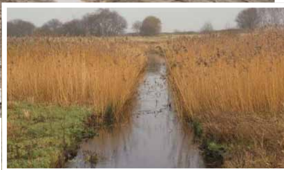
A mature reed bed