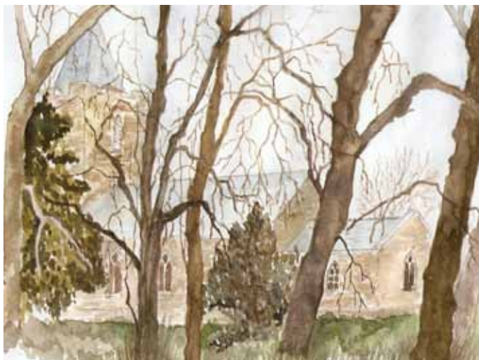
St. Peter's Church as viewed from the WEA in Church View (watercolour © Mary Challenger)

The history group is looking to its next project – the history of Blaenavon from the demise of the Blaenavon Company in the 1950s through to the area's modern day reinvention as a UNESCO World Heritage Site. The group would welcome new members. If you are interested, please contact the WEA on 01495 791128.