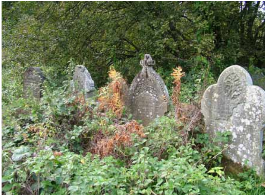
St. Peter's Churchyard is currently very overgrown