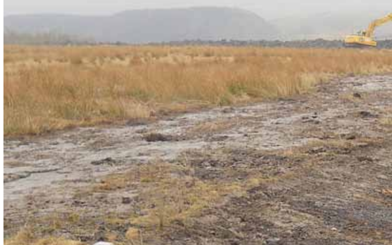
The new reed bed