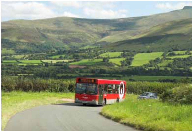
Beacons Bus

To find out more about the Blaenavon service and other destinations you can visit on the bus around the Brecon Beacons National Park, visit www.travelbreconbeacons.info .