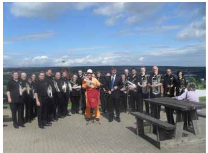
Music on the Patio at Big Pit

For information visit www.museumwales.ac.uk or call 01495 790311.