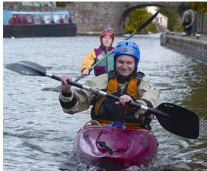
Activities on the canal

For more information please visit www.visitblaenavon.co.uk