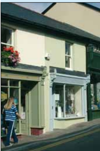
32-39 Broad Street