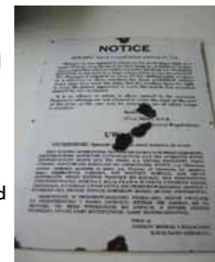
English/Polish colliery notice

This idea for the booklet came from my own personal experience of working alongside fellow workmen at Cwm Colliery who had very strong east European accents and equally strong work ethics. I was fascinated by their stories about Monte Cassino or the partisan war in the former Yugoslavia and I marvelled at both their