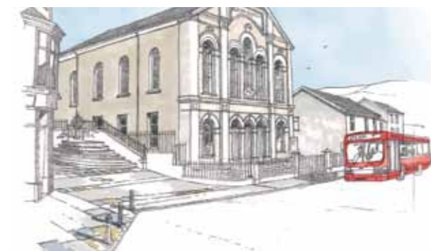
View towards George Street

The junction of Ivor Street with Broad Street will also be improved with traffic calming measures in the form of chicanes introduced along the one-way system. Widespread public consultation has taken place and comments have been taken into account in finalising the system. Implementation of the system will commence later in the year.