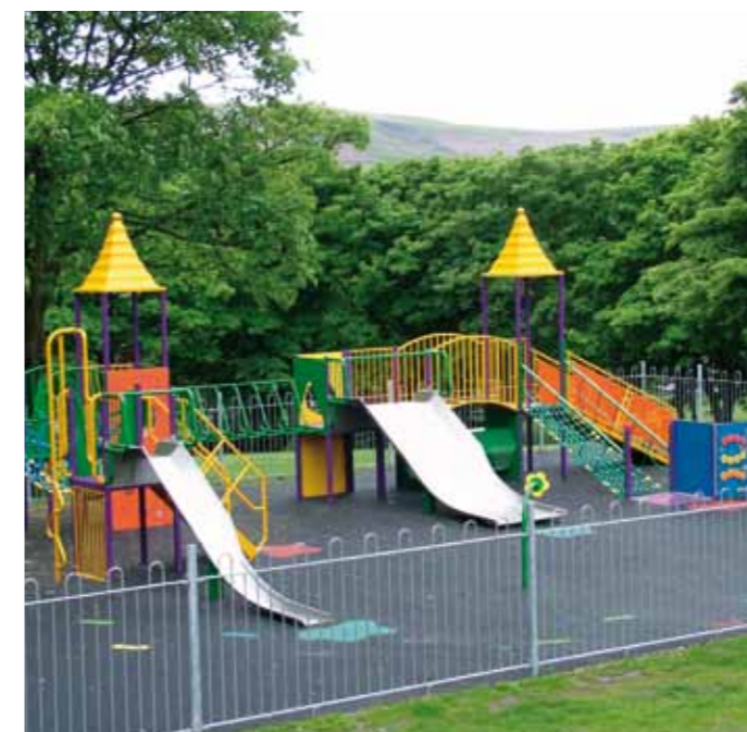
New play area at Blaenavon Park