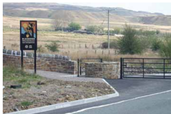
Improvements to the road approaches on the B4248 at Blaenavon

Over the winter, works to the road corridors into Blaenavon have significantly improved the approach to the town thanks to funding from the Heads of the Valleys programme. Following detailed consultation with local residents and members, the entrance to Garn-yr- Erw along Garn Road has been transformed with new timber fencing, walling and signage dramatically enhancing the entrance to the village. The boundary sign at Whistle Road has been improved and at Llanover Road a new parking area has been created, signs and seats installed and stone walls erected following consultation with the Blorenghe Commoners Association.