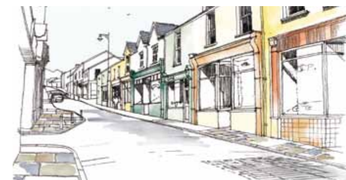
View from Burford Street junction