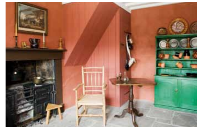
Inside one of the cottages

live and work for up to 14 hours a day! Mam and her daughters will be at the heart of the family life. Without their work family life will grind to a halt.