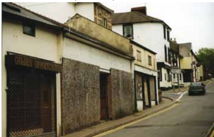
'Plywood City' - many of Blaenavon's shops were boarded up by the 1990s

In 1997 a survey of Blaenavon residents revealed that most local people felt ashamed of the neglected appearance of their town. Over £15 million of public and private money has since been invested into the historic centre of Blaenavon. 75% of the dereliction in Broad Street has been made good; 500 residential and commercial properties have been renovated; car parks and public amenities have been