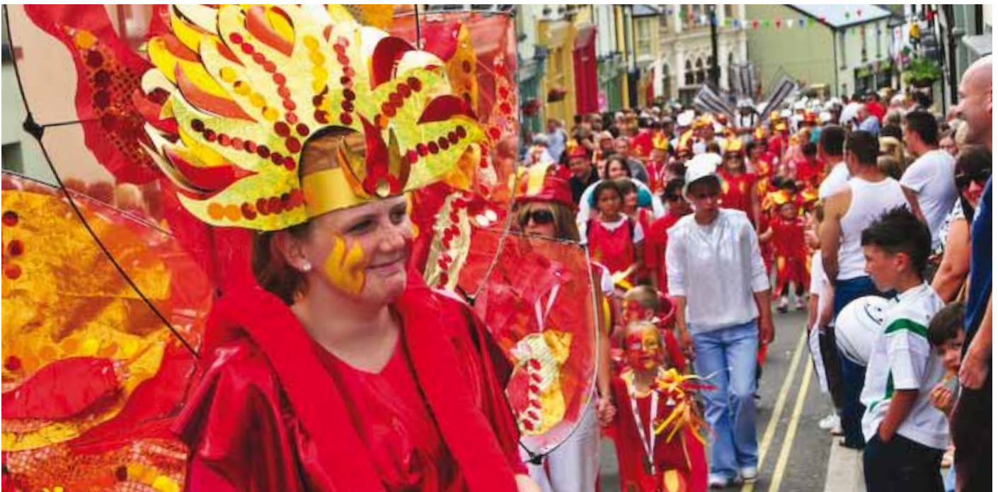
A scene from this year's World Heritage Day

For more information on the 'extravaganza' please visit www.blaenavonchristmas.com .