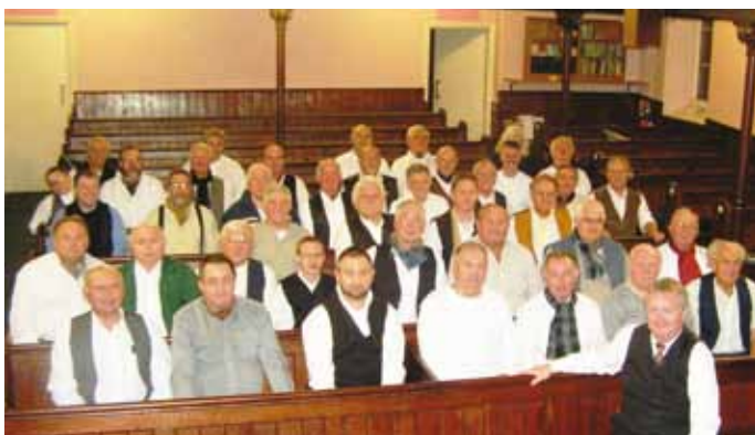
Blaenavon Male Voice Choir performing for the BBC Coal House series

An exhibition about the choir will be shown at the World Heritage Centre in February.