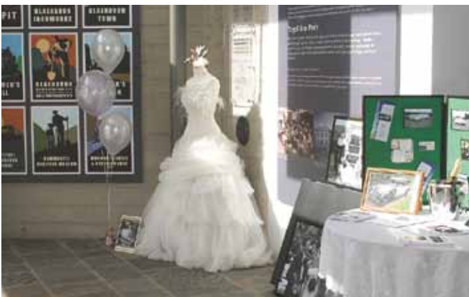
Wedding fayre at Blaenavon World Heritage Centre