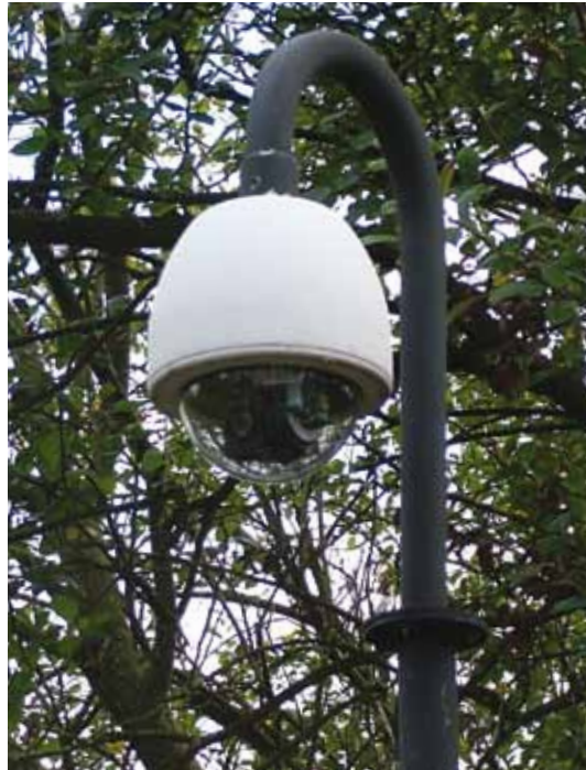
CCTV Camera in Blaenavon

Am ragor o wybodaeth, ewch i Wefan Heddlu Gwent - www.gwent.police.uk