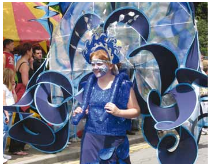
World Heritage Day is the highlight of Blaenavon’s busy calendar of events

Blaenavon has always been a close-knit community, with a wealth of groups and societies. World Heritage Status has helped ensure that these strong bonds continue into the new century. Blaenavon boasts an exciting calendar of events, including World Heritage Day in which community groups and schools always participate. Blaenavon has also become an important place of study, with thousands of schoolchildren, students and researchers learning here each year. Blaenavon offers much to people of all ages and backgrounds, for both locals and visitors alike.