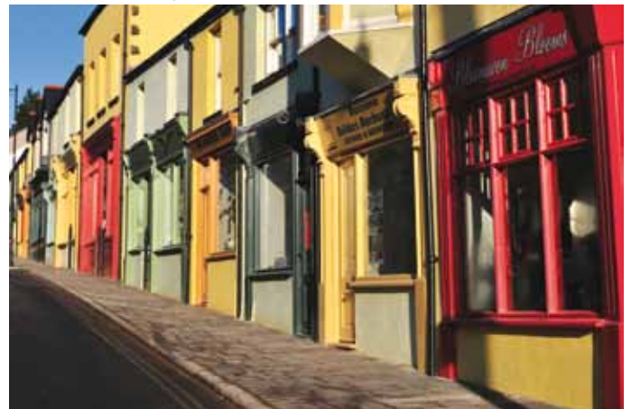
Following an ambitious regeneration programme, Broad Street has an attractive Victorian appearance

Blaenavon has had a major facelift in recent years and is now a town to be proud of; but what of the economic impact of World Heritage Status?