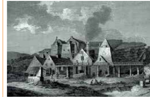
Gwaith Haearn Blaenafon / Blaenavon Ironworks

James' castles were the finest examples of military architecture of their kind in Europe so it's not surprising that he became the best-known medieval mason in Wales.