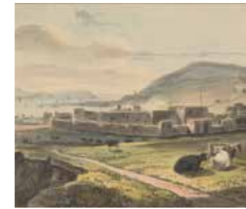
Biwmares / Beaumaris