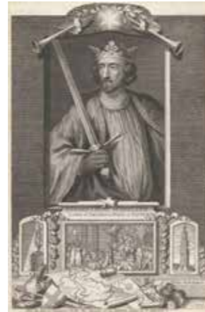
Y Brenin Edward I (Print gan George Vertue (1684–1756) ar ôl delw gan gerflunydd anhysbys. Yale Centre for British Art)

He was supervised by the more experienced William Jessop , the most prolific engineer of the early Canal Age. Whilst Pontcysyllte Aqueduct was Jessop's greatest achievement, the project paved the way for Thomas Telford to become the most famous engineer of his generation.