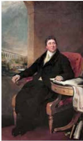
Thomas Telford