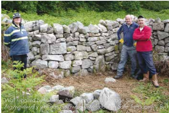
Wall repaired by Volunteer Rangers in World Heritage Site Atgyweirwyd y wal gan Gwiffoddol yn Sallie Trefadaeth y Byd

land secure. This means that livestock grazing will be more effective in benefiting wildlife.