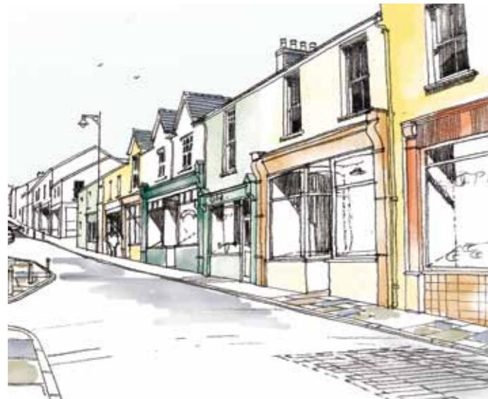
View looking up Broad Street

Following two studies, carried out by consultants Capita Symmonds and an extensive public consultation exercise, a one-way traffic system travelling up Broad Street was recommended to the Council.