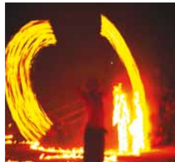
Scene from last years event

On Thursday 6th December, the streets of Blaenavon will be ignited by a parade of magnificent lanterns, music and light led by a giant smoke belching "King Dragon". The parade, which will start at 6:00pm from Market Street car park, will proceed up Broad Street and enter the Ironworks where a spectacular fire finale will tell the story of how Blaenavon grew from a rural wilderness to a bustling centre of industry.