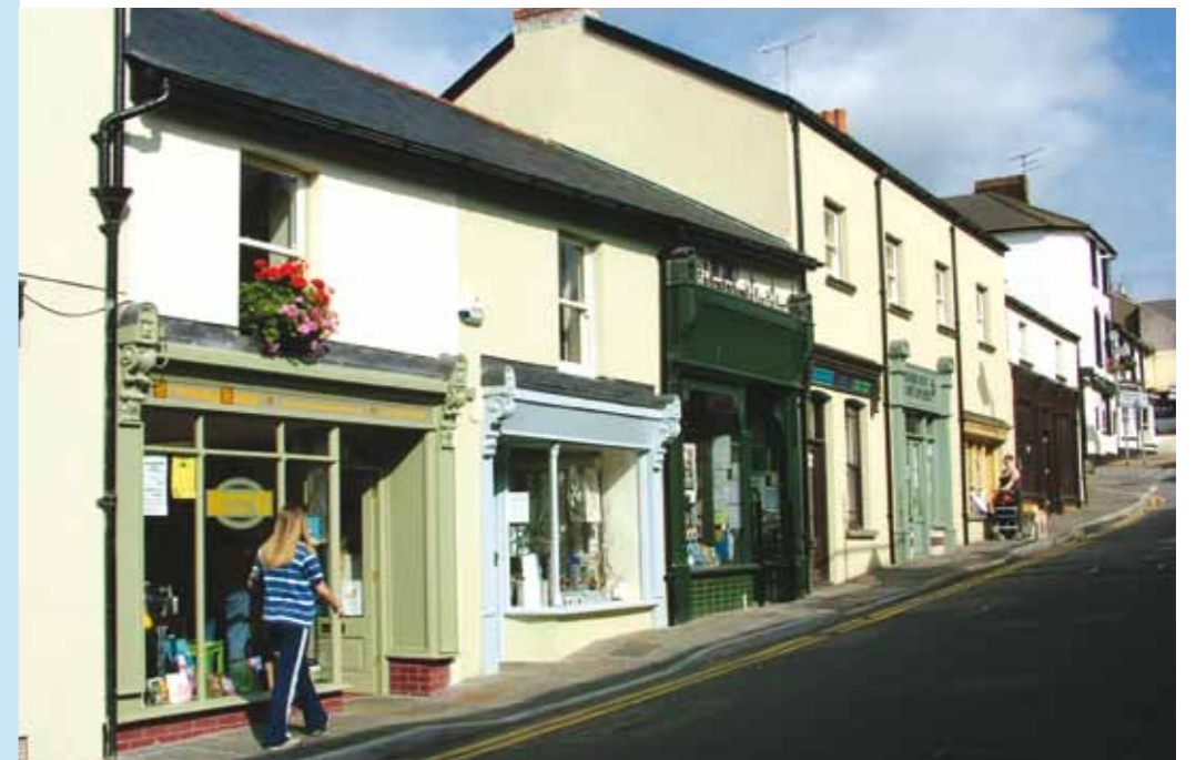
32 - 39 Broad Street after renovation