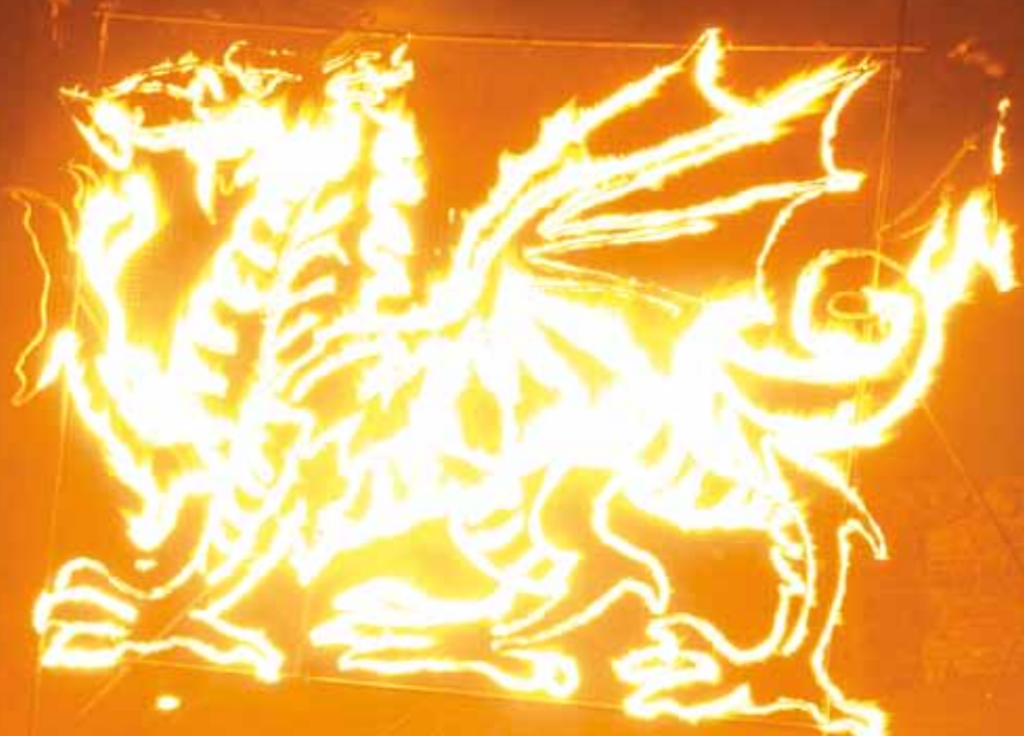
Flaming Dragon from last years event