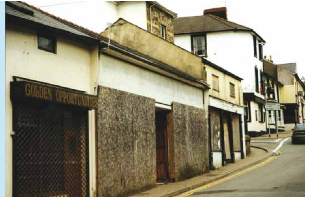
32 - 39 Broad Street before renovation work