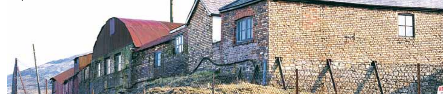
Big Pit, Blaenavon

For more information on what's on at Big Pit, please visit www.museumwales.ac.uk or telephone 01495 790311.