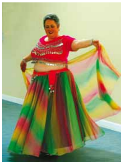
Belly Dancing at Blaenavon

Am amrediad lawn o'r cyrsiau, neu os oes gennych unrhyw geisiadau, cysylltwch â Chanolfan Addysg Gymunedol Blaenafon ar 01495 792013 neu e-bostiwch blaenavon.commed@torfaen.gov.uk