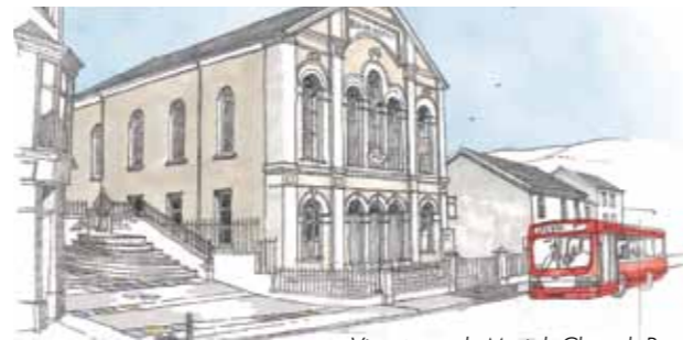
View towards Moriah Chapel, Broad Street