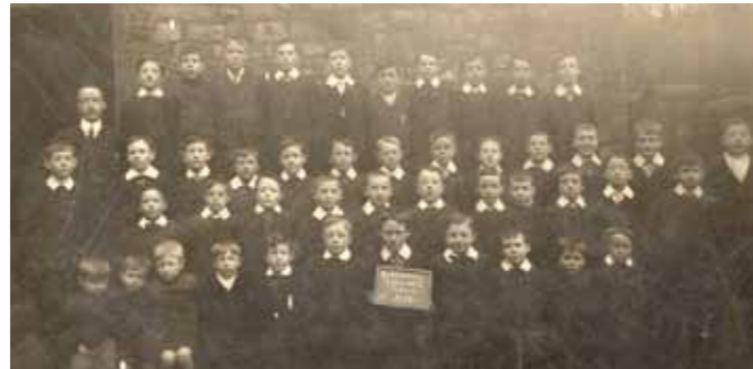
The Boys' Endowed School in 1910.