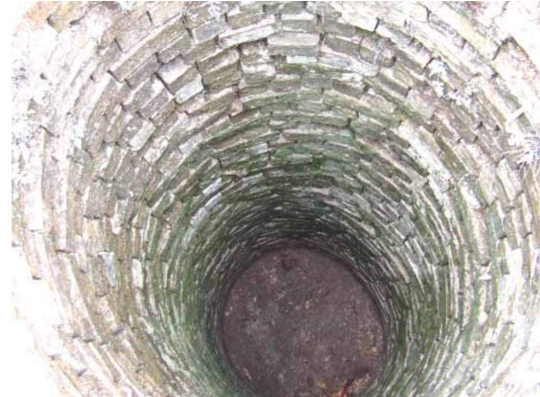
The chimney interior following restoration

The chimney at Hill's Pits, Garn Yr Erw, has been saved from collapse through the intervention of Torfaen Council in partnership with the Welsh Assembly Government and the Walters Group.