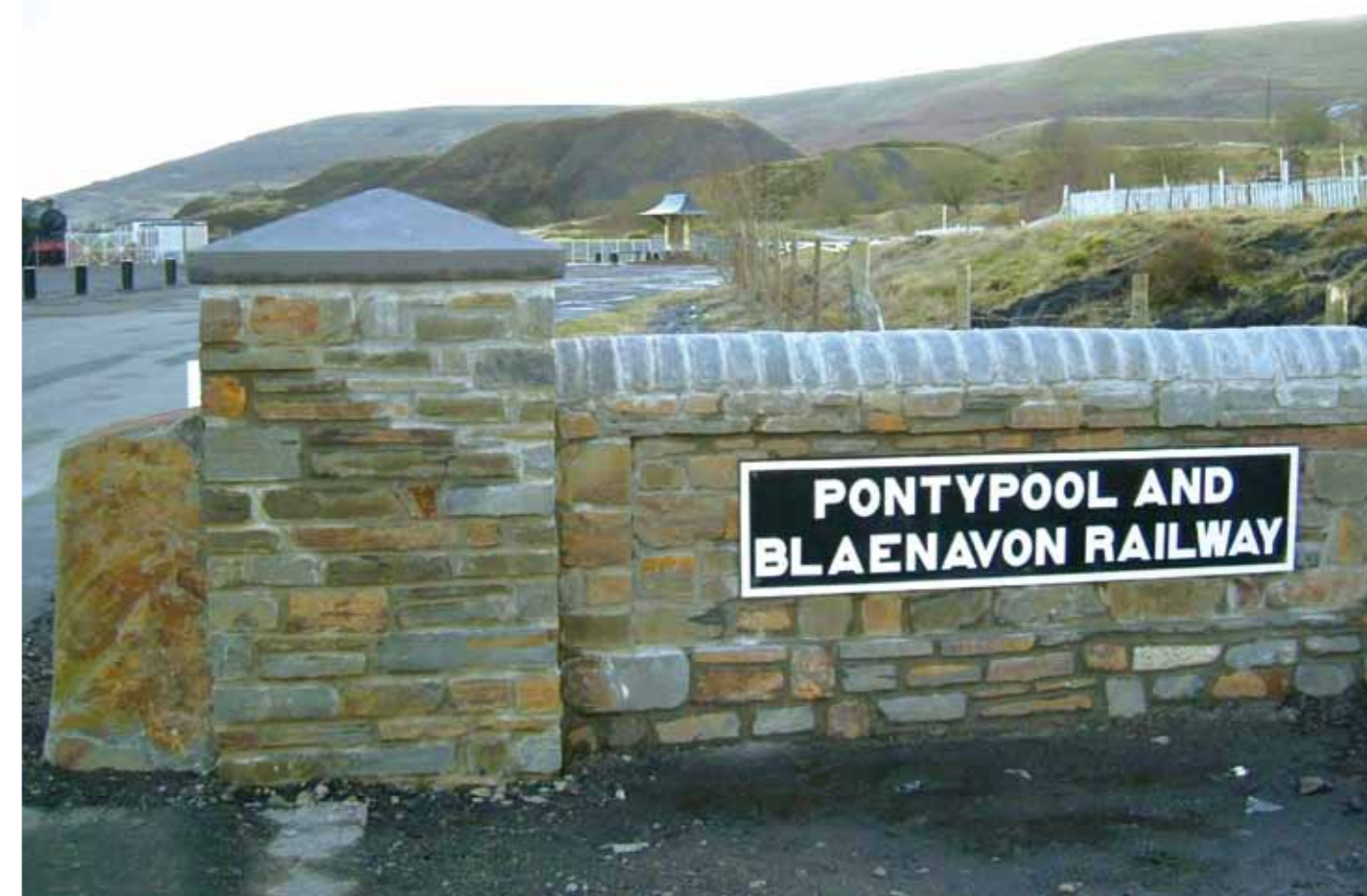
Pontypool & Blaenavon Railway

Also celebrating its Silver Jubilee in 2008 was the Pontypool and Blaenavon Railway, which opened in August 1983. The anniversary was successfully marked by a well-attended weekend gala on