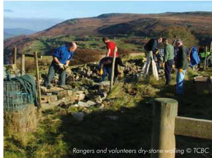
Rangers and volunteers dry-stone walling