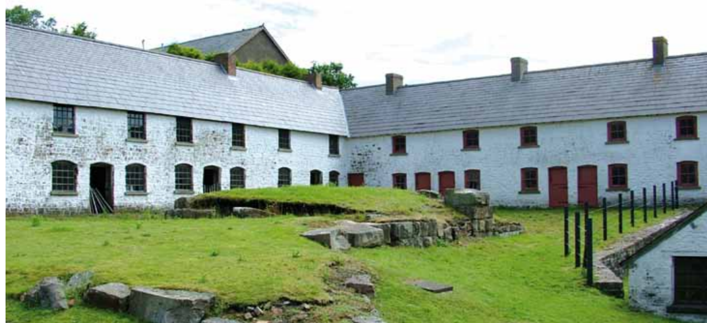
Stack Square

The first series, set in 1927, enjoyed considerable acclaim, being a major topic of conversation in Blaenavon and the rest of the country. The series, which strongly engaged with the community, transformed the Coal House families and the businessmen of Blaenavon, who participated in the programme, into local celebrities. The quality of Coal House was recognised by BAFTA Cymru who, in April 2008, presented Indus Films, the producers of the series, with the prestigious Gwyn Alf Williams award for the programme's contribution to the understanding and appreciation of Welsh history.