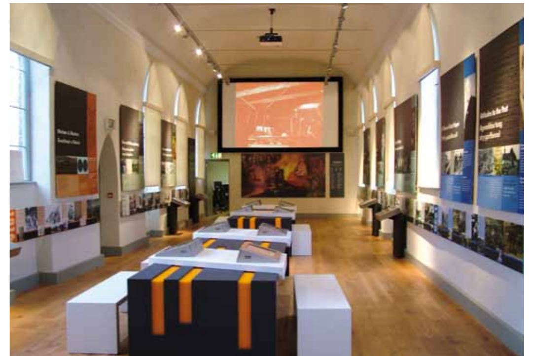
The exhibition room of the World Heritage Centre