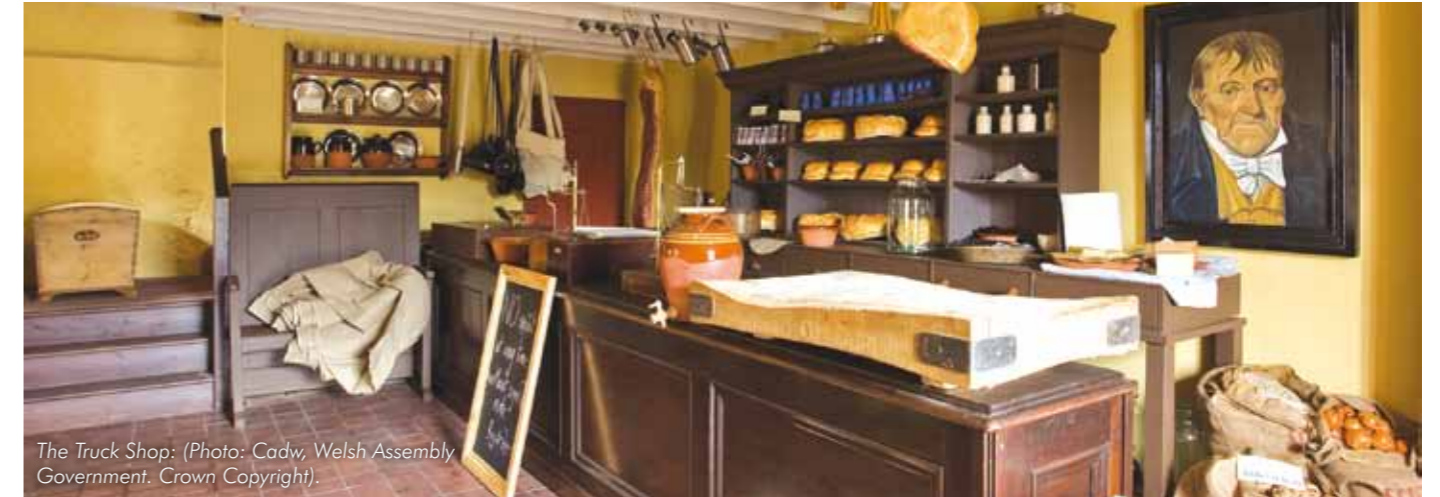
The Truck Shop