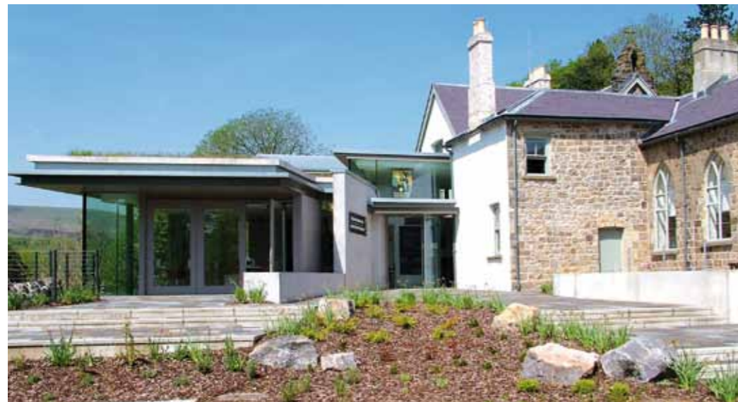
World Heritage Centre

For almost a quarter of a century the Church Road buildings lay vacant and dilapidated but the investment of £2.7 million from the Heritage Lottery Fund, Cadw and Welsh Assembly Government has ensured that a high-quality, sympathetic restoration has been completed, incorporating an impressive glass link connecting the former girls' and boys' schools. The successful combination of the old and new buildings was recognised in May when the centre became the sole Welsh recipient of a prestigious award from the Royal Institute of British Architects. Paul Murphy, Secretary of State for Wales, formally presented the award to the architects,