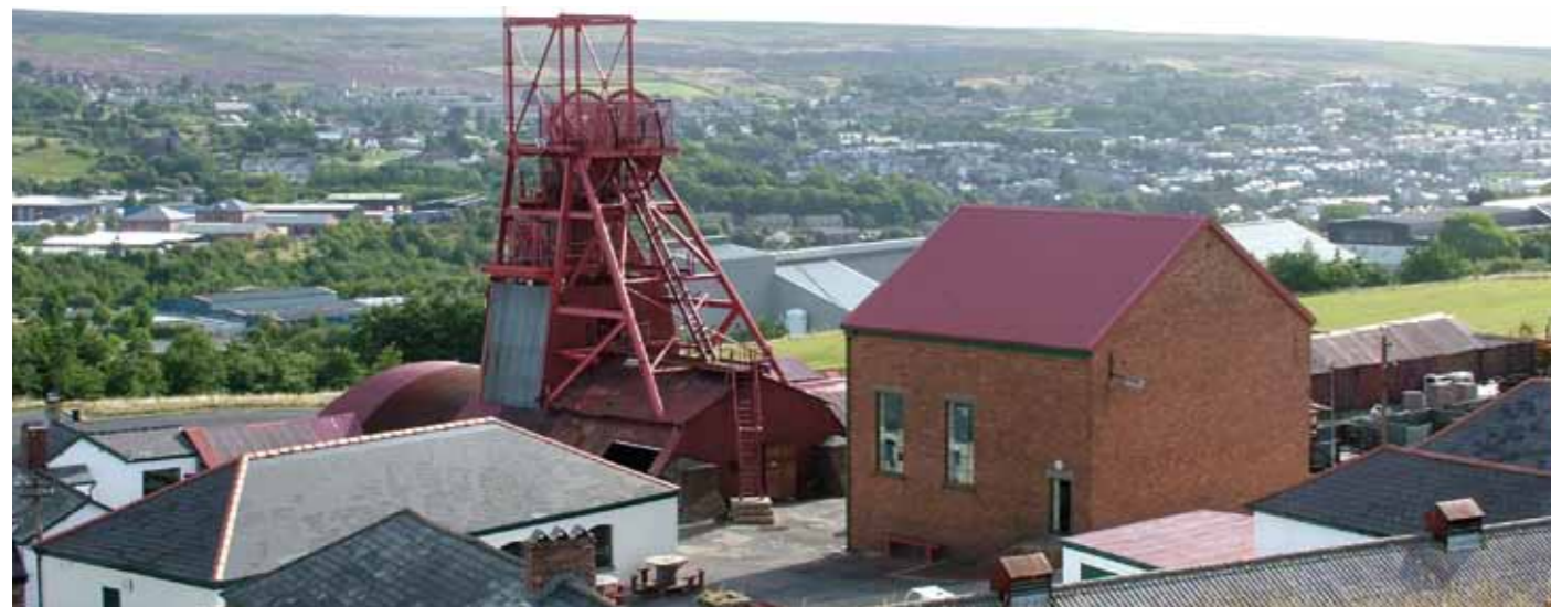
Big Pit

Since 1983 over three million people have been welcomed to the site and, with its enduring popularity, Big Pit will continue to bring global attention to the coalmining heritage of Wales for many years to come.