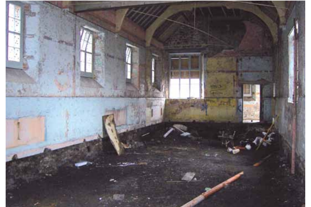
The dilapidated interior of the former boys' school