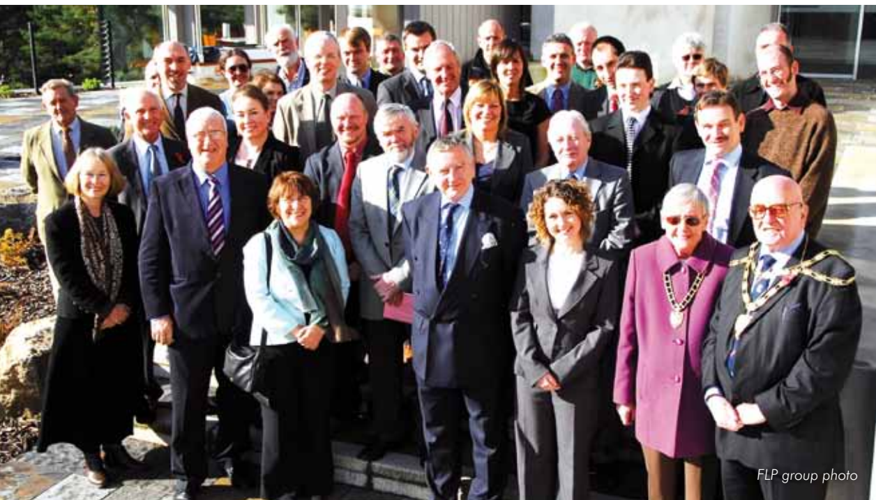
FLP group photo